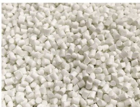
PICTURED: Close-up of PX2 Grade

PX2 Grade is available in: • 44 lb. bags (pictured above)